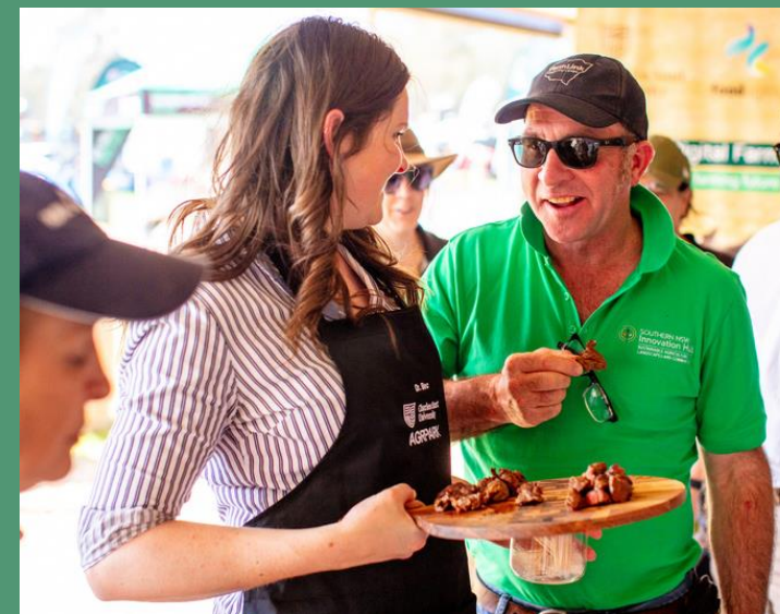
Red Meat Innovation Centre