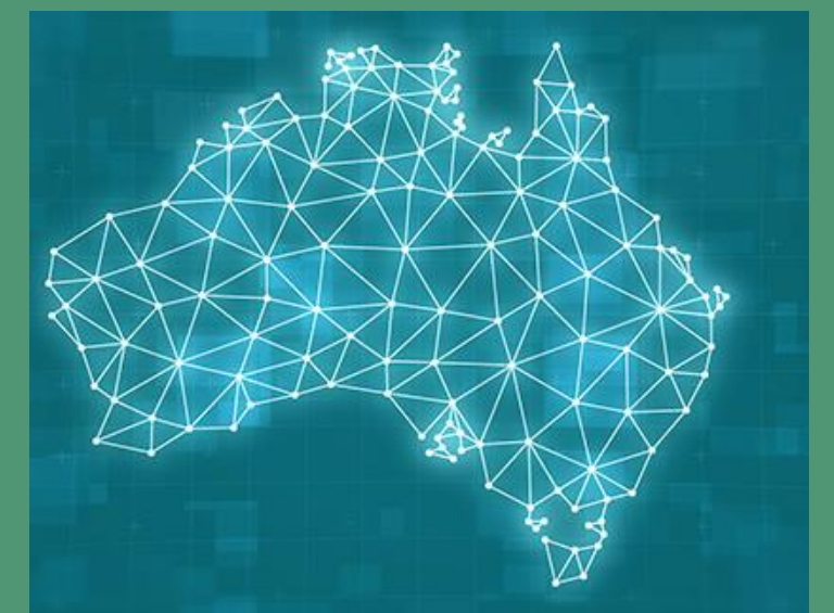
Aust. AgriFood Data Exchange