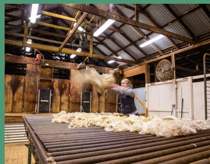
Charles Sturt Farm