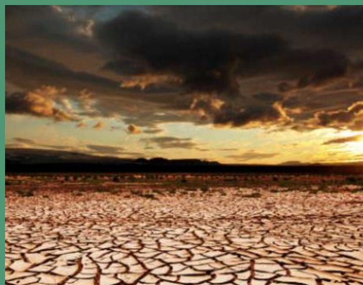
Southern NSW Drought Hub