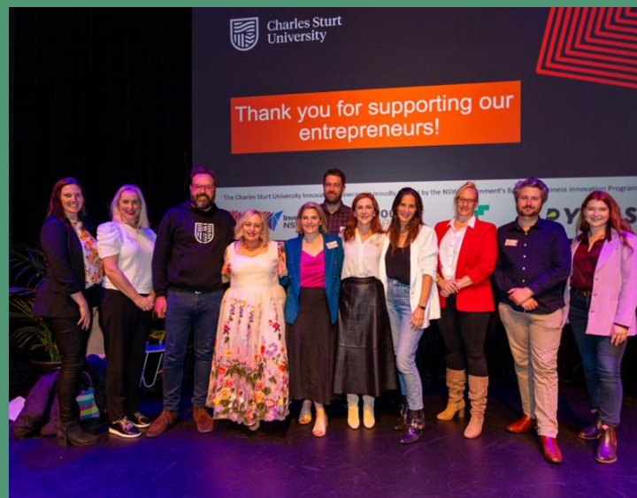
Innovate at Charles Sturt