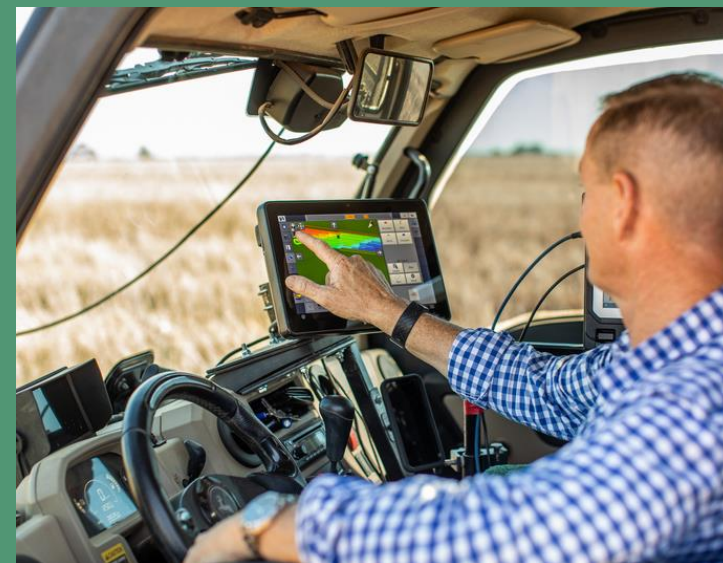
Global Digital Farm